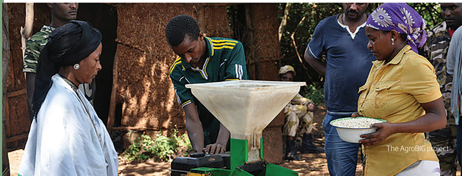
The AgroBIG project

Technical and vocational education and training (TVET) is a growing sector in Ethiopia. The development of a skilled workforce is important for economic development and also creates prospects for the country's rapidly growing population. NIRAS is at the forefront of delivering technical support, capacity development, investment support and improvement of TVET curriculums, including the agriculture sector. NIRAS also works within inclusive and equitable primary education to improve access to education in accordance with children's specific needs.